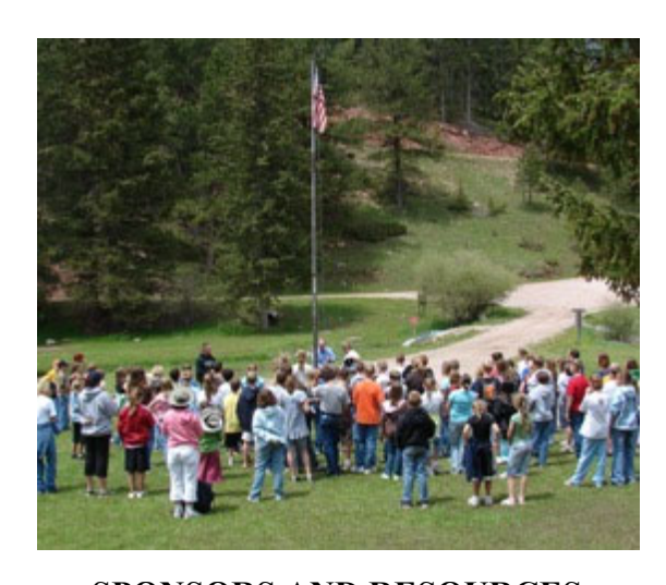
SPONSORS AND RESOURCES Campbell County Conservation District Powder River Conservation District Weston County Natural Resource District Campbell County Community Public Recreation District