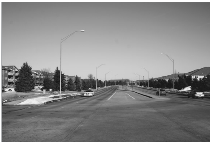
A single row of trees will not provide noticeable noise reduction. At best they will provide a visual screen between residents and the noise source.

To achieve a 10 dBA reduction (one half the noise level) either a very wide dense tree planting or including a solid barrier is necessary. Solid barriers can be either an earthen berm or a solid wall or fence. If a berm is utilized trees and shrubs should be planted on top and near the recipient. Planting on top of the berm creates a relative increase in height of the trees with respect to the recipient. Solid barriers also reflect sound back toward the source. If this is an issue, a row of shrubs can be planted near the solid barrier on the source side. If a solid wall is constructed the least effective location is within the tree planting and the most effective location is near the source.